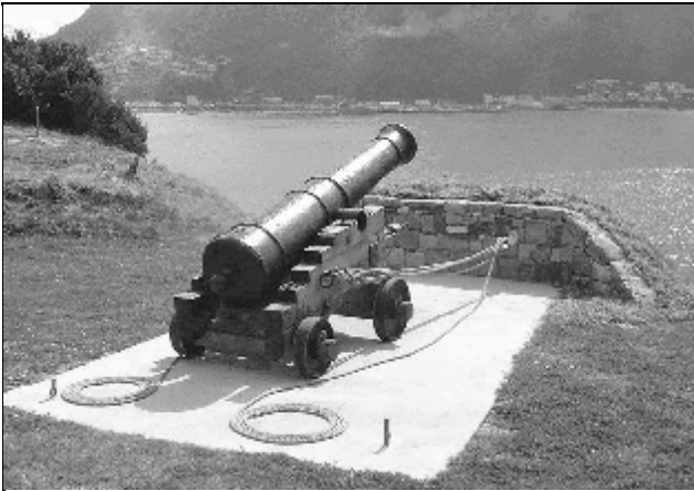
East Fort's 'new' Gun Pit with one of the eight 18 pounder c.1752 cannon now fitted with blocks and tackle so that it can be "run out" before firing. Hauling the 2.5 ton gun into position is a great challenge and thrill for our visitors, never to be forgotten. A wonderful heritage project which we

The Hout Bay and Llandudno Heritage Trust is a non profit organisation dedicated to our community's proud heritage. We are fortunate to have on-board some of the community's most talented people who work unstintingly for the betterment of all to engender a spirit of community pride, the cornerstone of a proud nation.